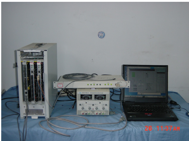
Figure 2 Portable PSC/PSI Configuration

The VME based PSC/PSI system has been built up. Figure 2 is portable configuration for VME based test. It is comprised of a small VME crate with a CPU board and PSC connected to a remote PSI.