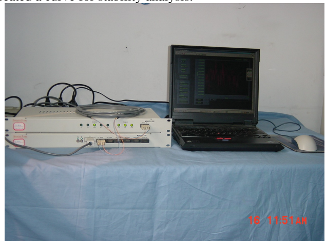
Figure 3. Standalone PSC Configuration.

This system has also been tested with the prototype power supply including current setting and readback in normal mode. For fast reads, burst mode is used and data is stored in memory. Data in memory can be read out and created a curve for stability analysis.